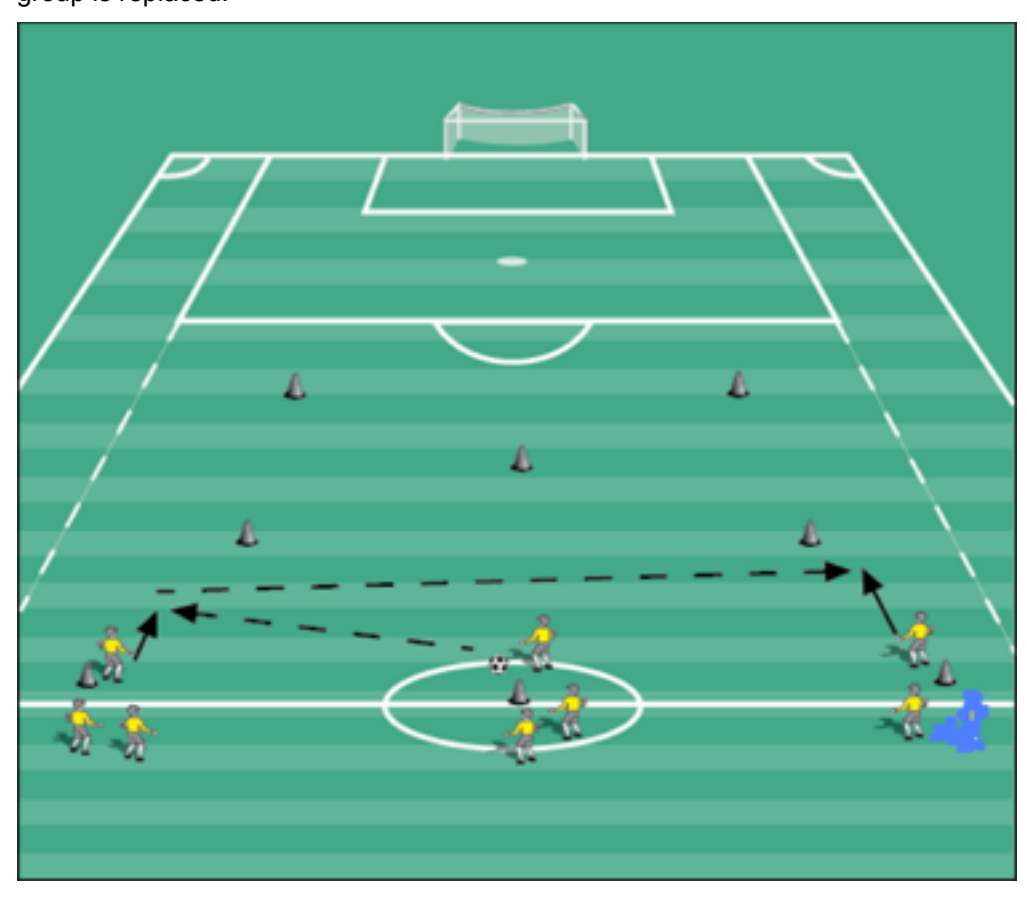
Figure Eight Three midfielders will do the figure eight until the edge of the goal area and finish in goals. The players start with two touches and then go to one touch. Cones simulate defenders. If the cone is touched the group is replaced.

Attacking Corridor - 2 v 1 In Zone A1 progress to 3 v 2 in zone A2 and then finish in goal only inside the goal area.