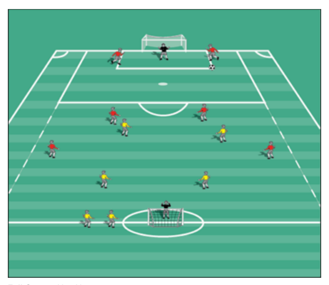
Full Game - 11 v 11 Goals through the middle are worth 2 points.